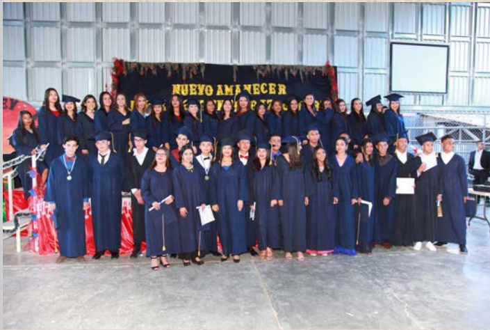
Grade 11th B