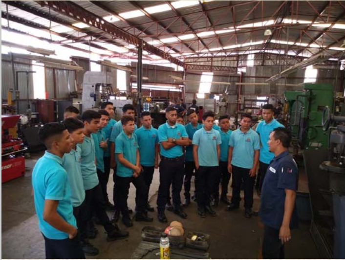
Visit of an industrial workshop of the group of industrial mechanics