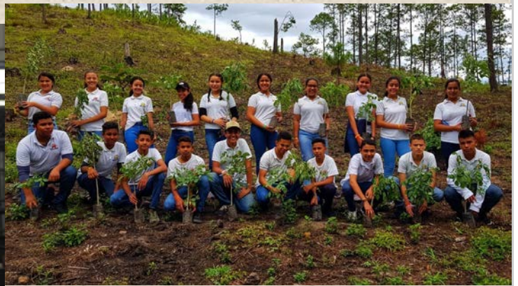
Excursion into the forest for reforestation