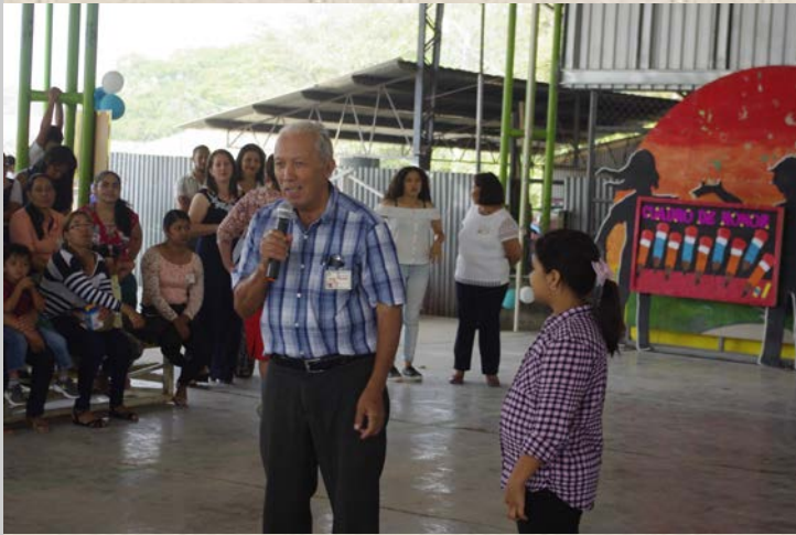
Activities during the Parents' Meetings