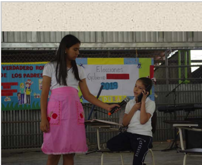
Various presentations by our students