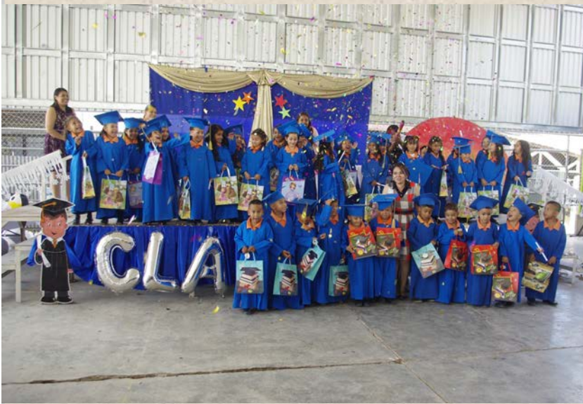
Graduation Kindergarten section A