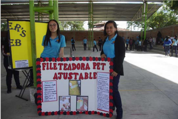
Some of the projects presented by our students