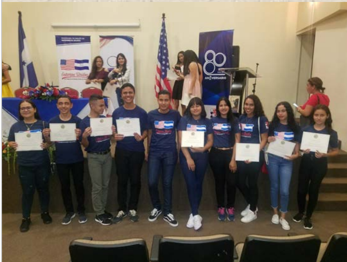
The IHCI scholarship holders