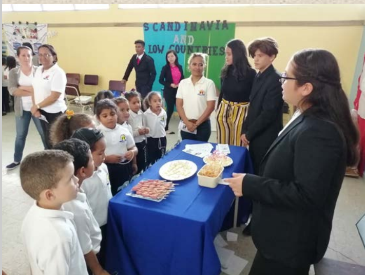
The ninth class presents projects