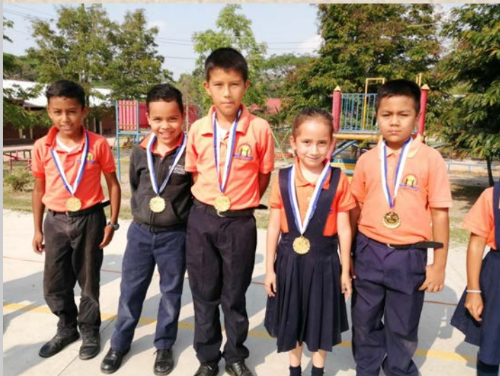
Prize in the day of the Castilian language