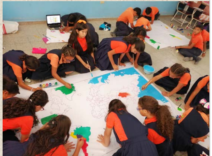
The fifth class A draws a map of the world