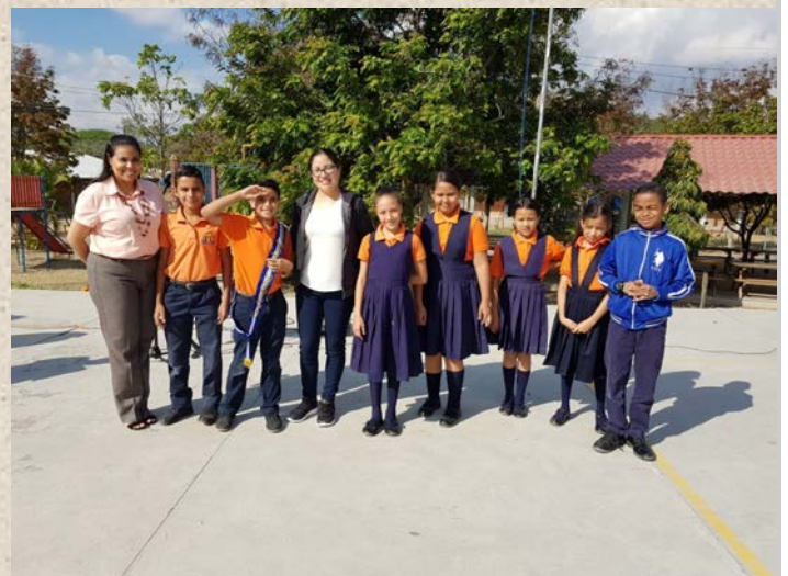
The newly elected student council