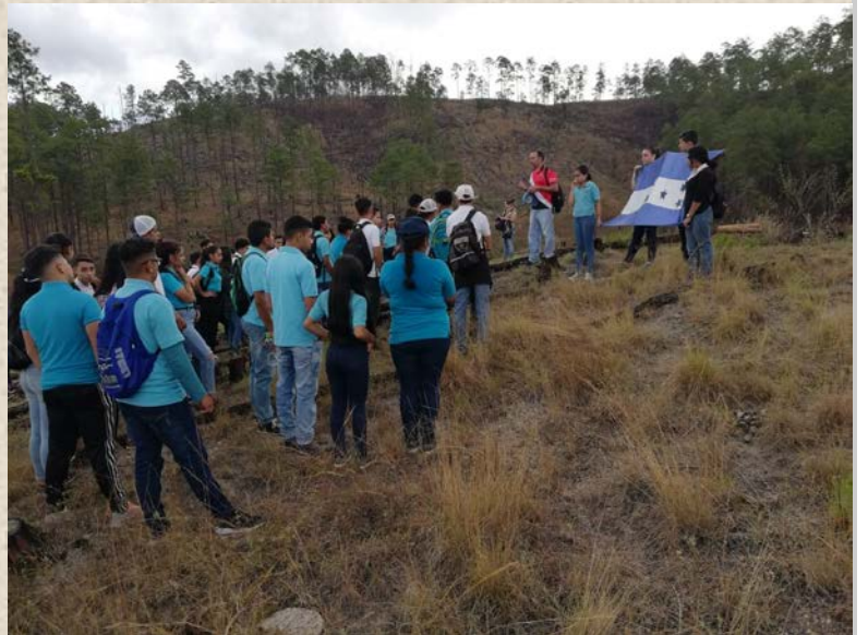
The graduating class opens the reforestation project