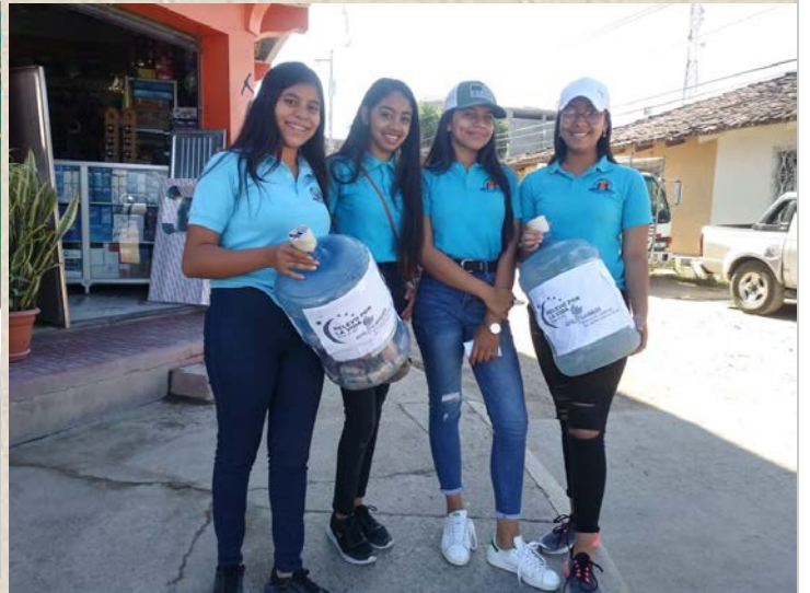
Collective campaign for children with cancer