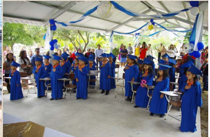
Graduation Kindergarten section B