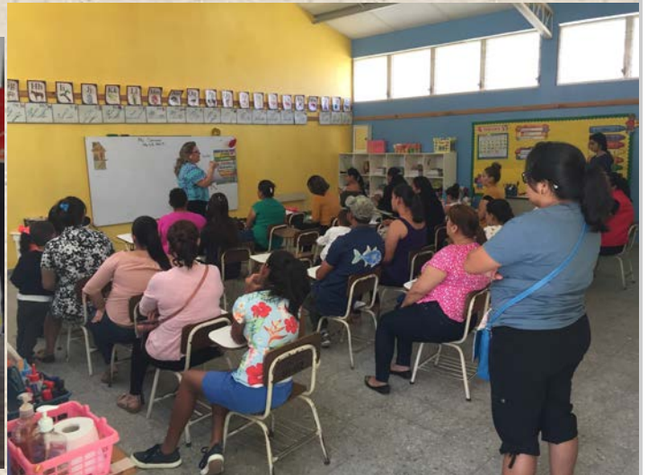
Instructions for parents