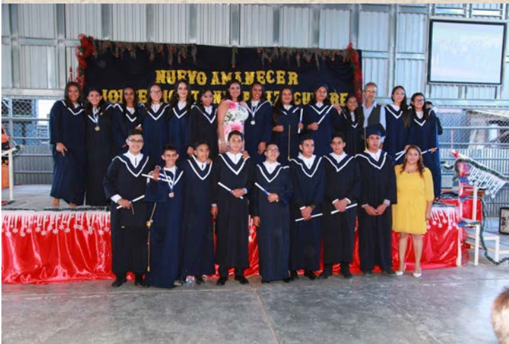
The bilingual ninth grade