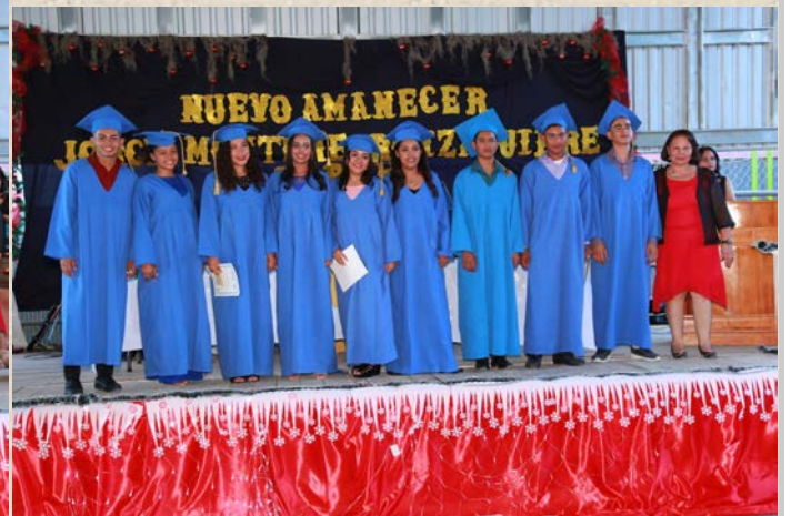
The ninth grade college and Educadodos