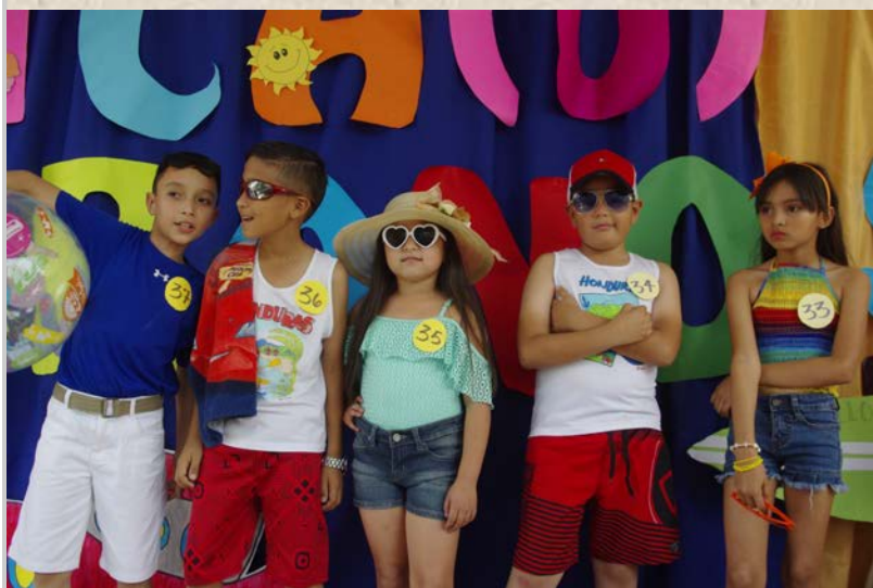
Choice of summer boy and girl