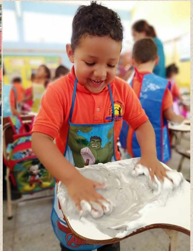
It's fun to work with your hands.