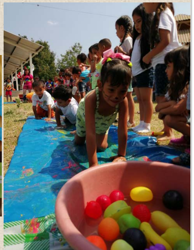
Fun at pool party day