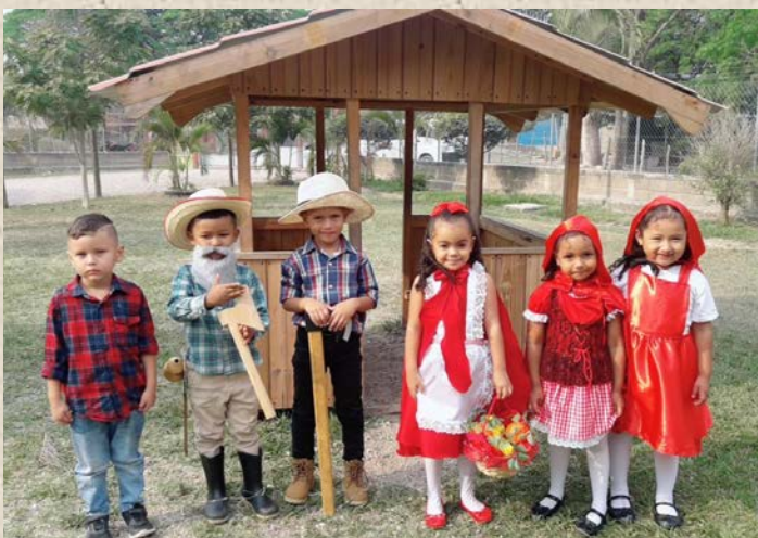
Little Red Riding Hood