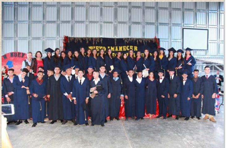
Grade 11th A