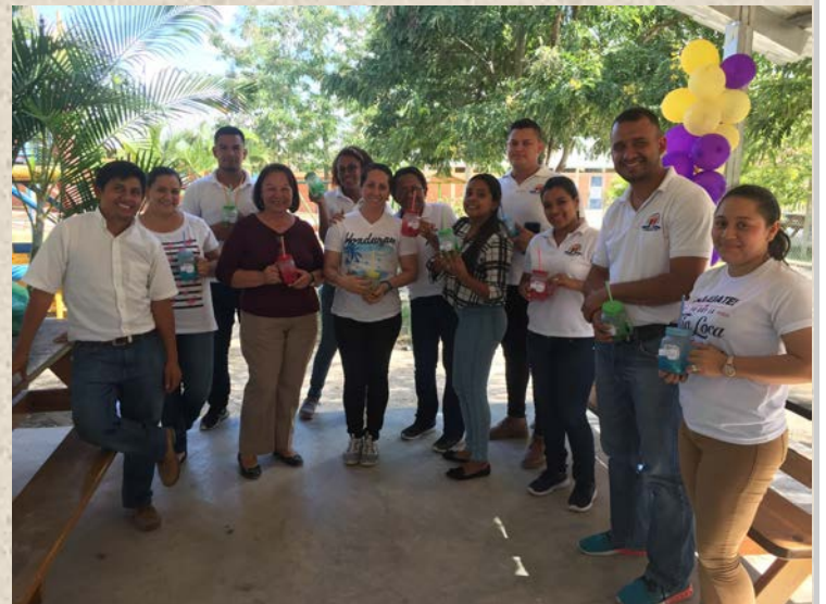
Birthday party of the employees