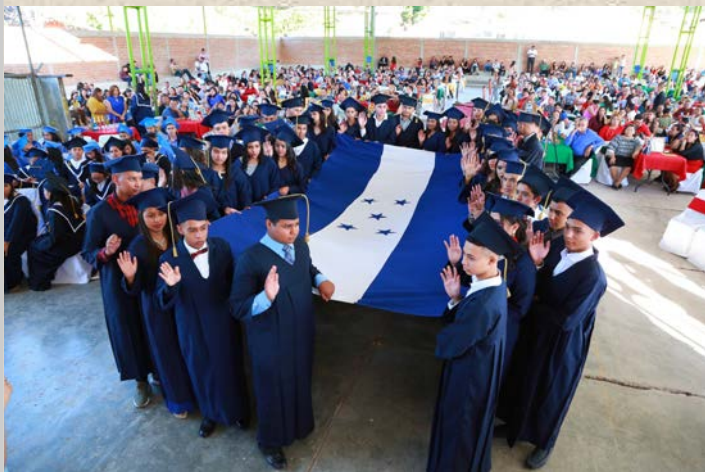
Pledging to the Flag