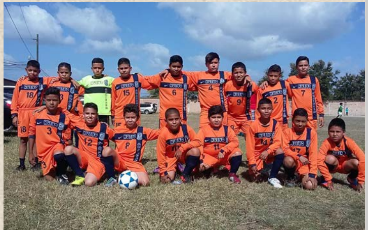
The soccer team of the primary school