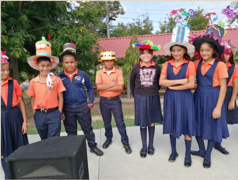
5th class student on the day of the hat..