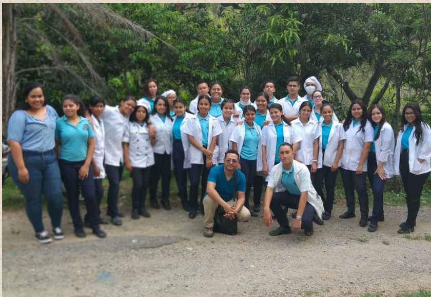
The bakers during the excursion