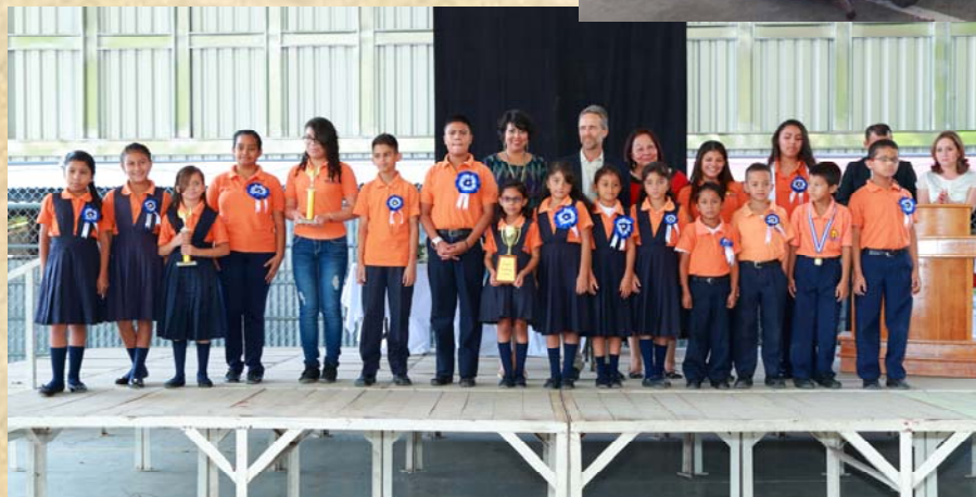
The best students receive an award