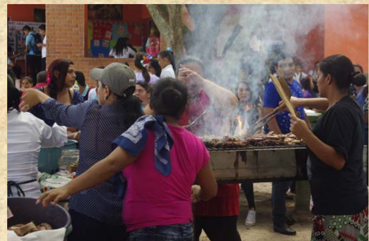
Food is prepared by the mothers and sold directly to the participants