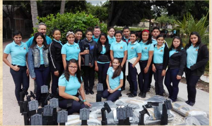
We receive a computer donation from Switzerland