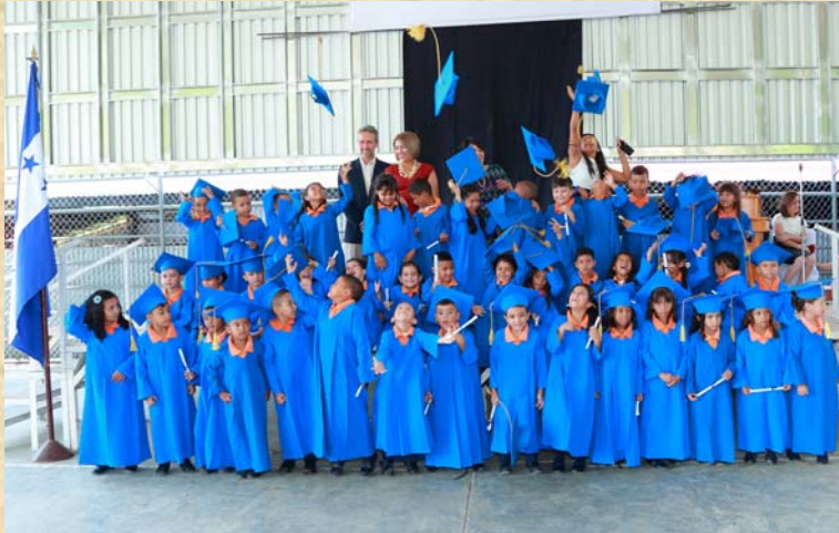
The proud graduates of Kindergarten section A ...