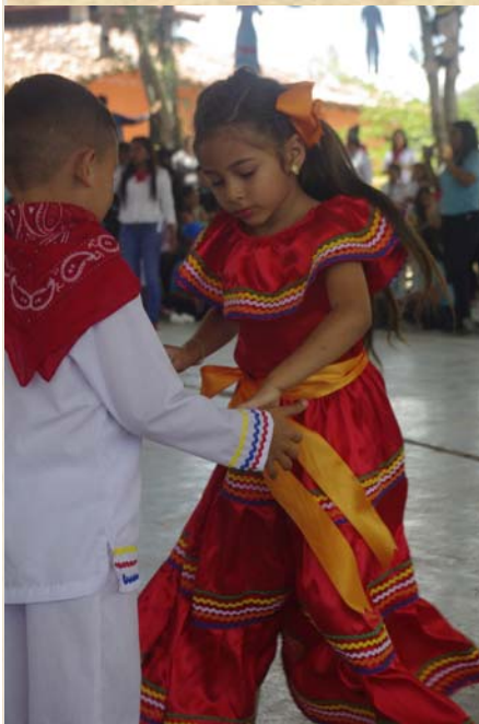
Our students present musical and dancer performances