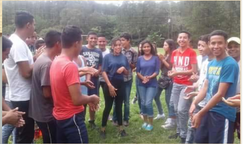
Sport Activities and ...