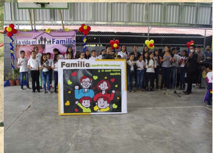
Celebration of the family day