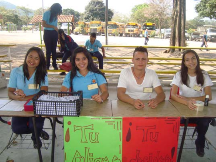
Student government election