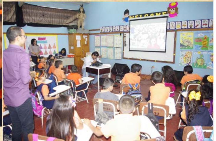
Our second grade during the video conference with the second grade of an American school