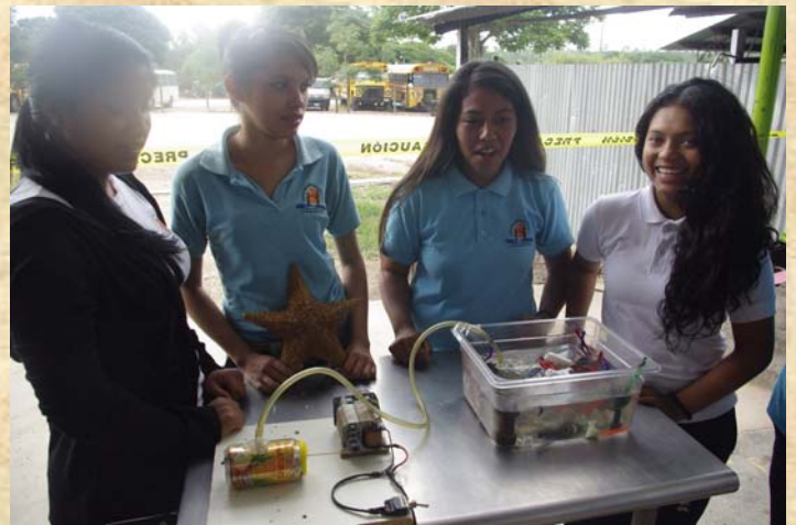
Some of the projects presented by our students