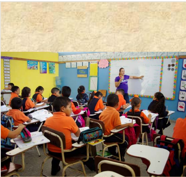
Frist grade section A