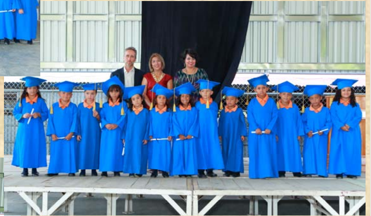
... and section B