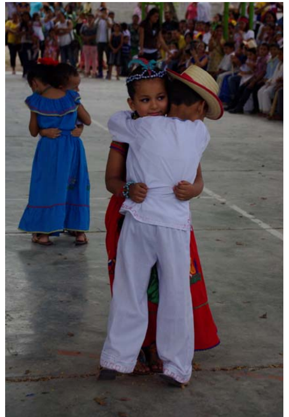
Dance performance of preschool