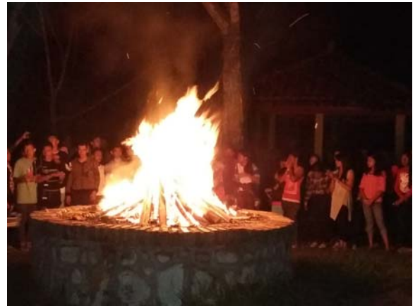
Prayer and worship around the bonfire