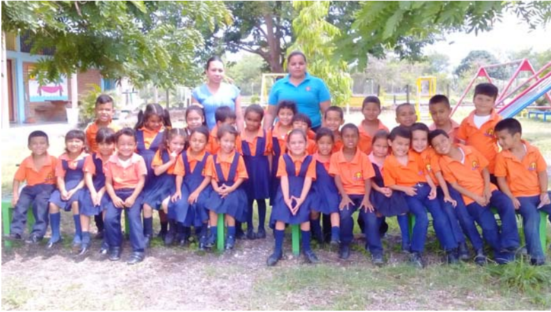
K5 section A