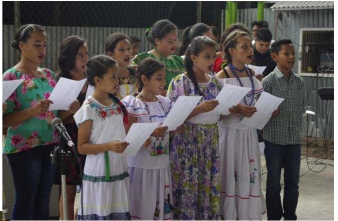
Presenting a song for the family day