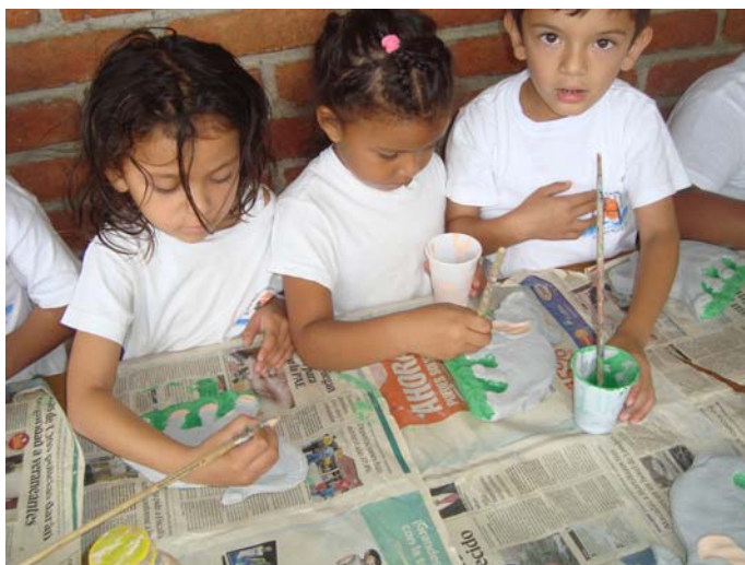
Our little ones at craft lessons