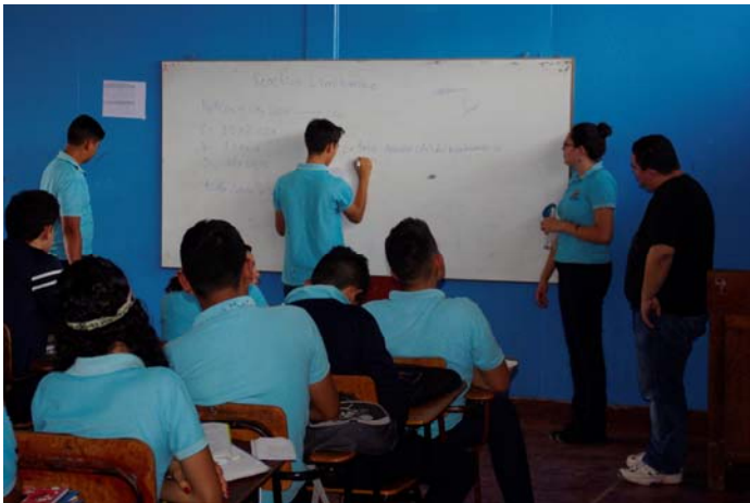
The tenth grade during class