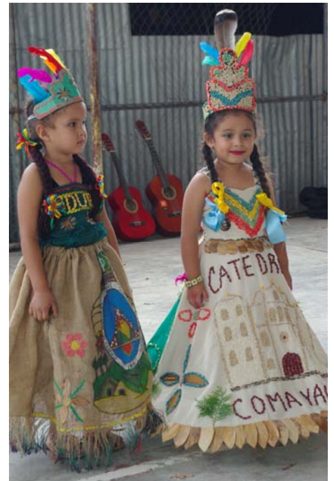
Participants to select the most beautiful "India"