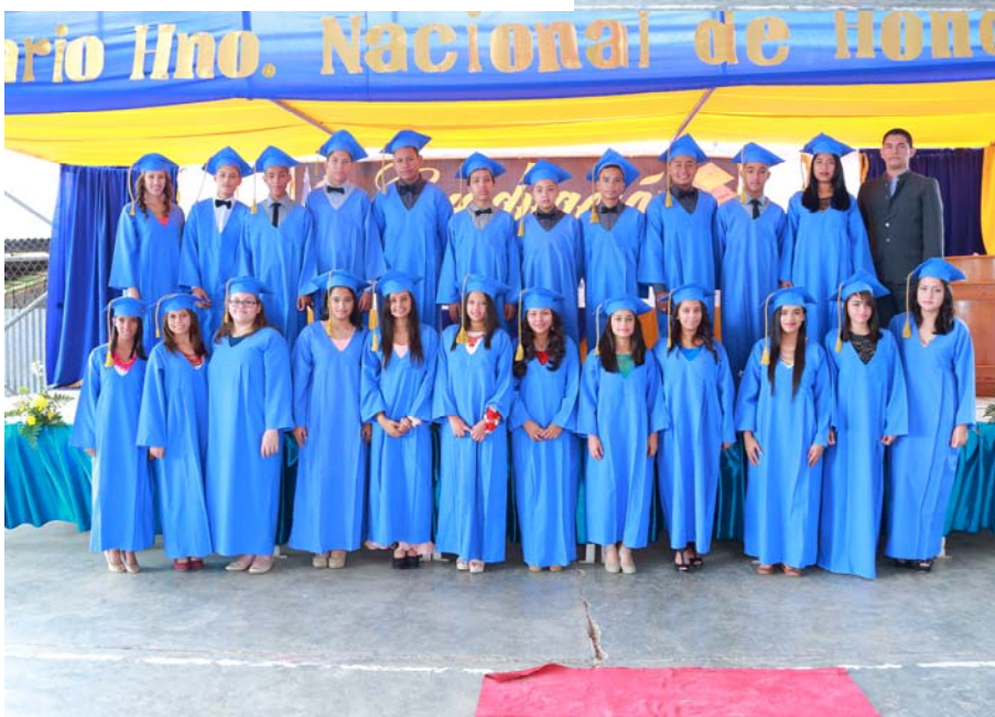
The proud graduates of Kindergarten