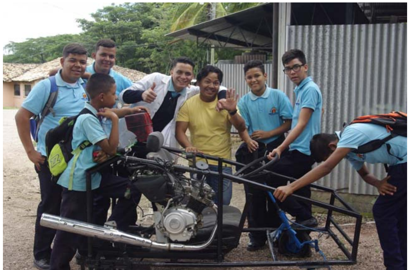
Some of the projects presented by our students