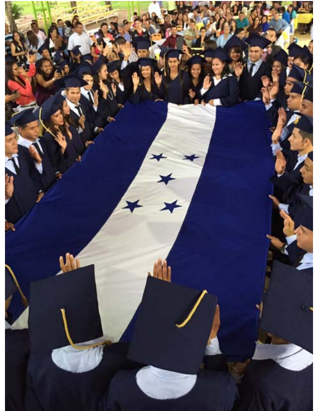
Pledging to the Flag