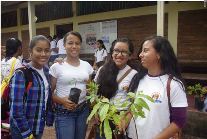
Trip into the forest