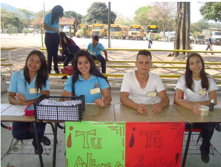
Student government election